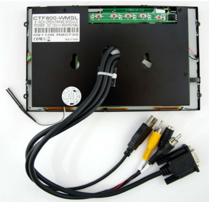
Support: <u>Dimensions</u> | <u>800x480 Driver (Windows 7)</u>